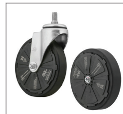
Cart containment systems: Gatekeeper, Cartronics, Rocateq, etc.