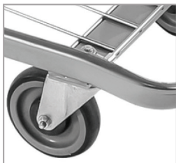
P&H Super Wheels, TPE Soft and Quiet Runner Wheels