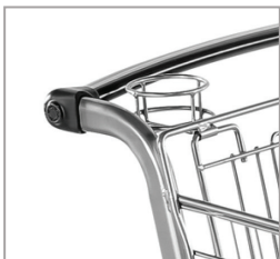
Plastic Cup Holder, Phone/Convenience Tray, Purse Hook