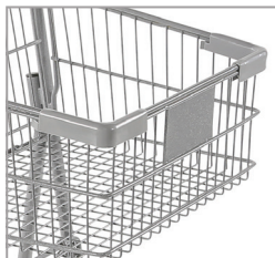
Optional Corner Bumpers in Standard Black or Gray